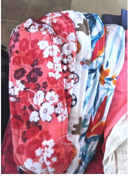
Washable Feminine Hygiene Pads

Over the past year and a half, the project has led teachings, Bible studies, and conversations at synod gatherings, men's gatherings, women's gatherings, youth gatherings, prayer leader gatherings, and theological seminaries. Every time the Gender Justice project holds a workshop, both women and men approach the Gender Justice Coordinator afterwards with more questions and much thanksgiving. Over time, the project has incorporated teachings on feminine hygiene, marital preparation, and marital relations as well.