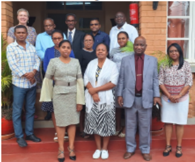
Welcome reception by Malagasy church leaders and project leaders supported by the ELCA.

I have been serving as an ELCA global missionary since 2016. It is hard to believe it has been nine years since I first packed three suitcases to begin a new life in Senegal, West Africa. As a pastor and global missionary, I have