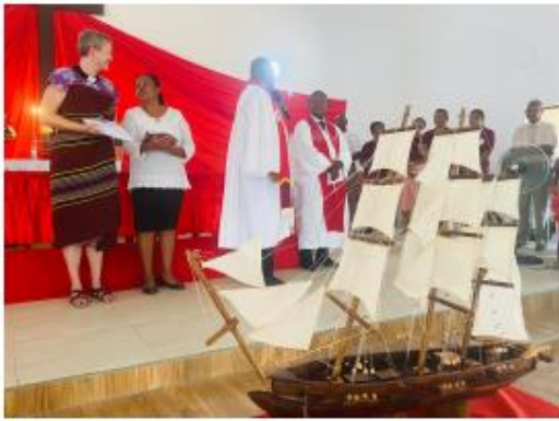
Welcomed in worship at Toliara synod in southern Madagascar. The boat is a welcome gift, symbolizing the journey missionaries take to arrive in Madagascar. ELCA missionaries have worked in southern Madagascar since 1888.