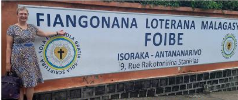
Malagasy Lutheran Church = Fiangonana Loterana Malagasy Foibe = Head Office

I wasn't able to send a Newsletter in 2024 to share about my new call in Madagascar. I have included photos below that show some of the ministries of the Malagasy Lutheran Church.